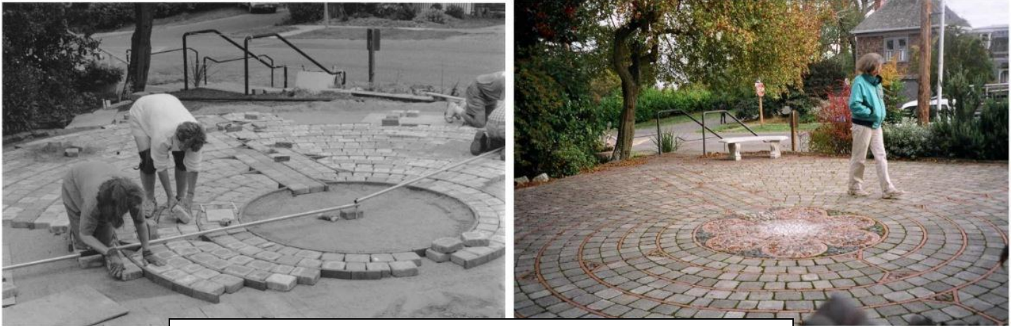
St. Paul's "Courtyard of All Souls" was largely built by parish volunteers.

In the late 1990's St. Paul's embarked on a capital campaign and built a new Parish Hall with a full service kitchen. Fenn House, the former vicarage, was re-configured and joined to the new building as offices and meeting rooms. The parish continued in improvements to the campus, adding the Columbarium in 2000, and completing a paved garden courtyard with inlaid labyrinth in 2004.