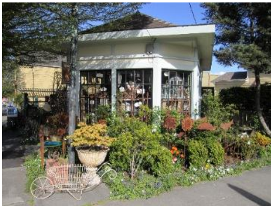
A shop in uptown Port Townsend.

Port Townsend's boom-and-bust history bequeathed its neighborhoods with a unique collection of late-19th Century homes, public buildings, churches, and parks. St. Paul's church is located within Port Townsend's historic district, which is a U.S. National Historic Landmark District.