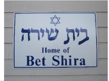
Sign on St. Paul's Parish Hall