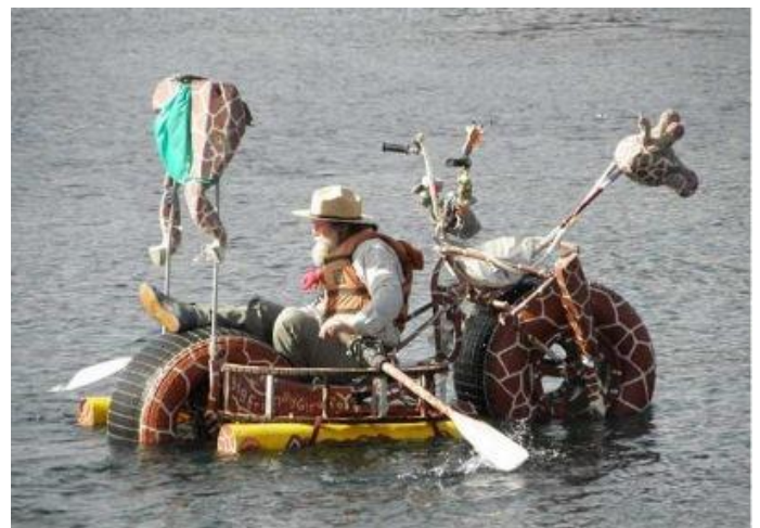
Recent entry in the Kinetic Skulpture Race

The community's unique setting has its pros and cons. With water and snow-capped mountains on all sides, Port Townsend is stunningly beautiful – and geographically isolated. The drive from Port Townsend to Seattle or SeaTac airport takes between two and three hours, depending on ferry schedules and bridge conditions. As a result, our community is more insular and self-contained than many, with residents who care about their town and tend to band together to solve problems locally.