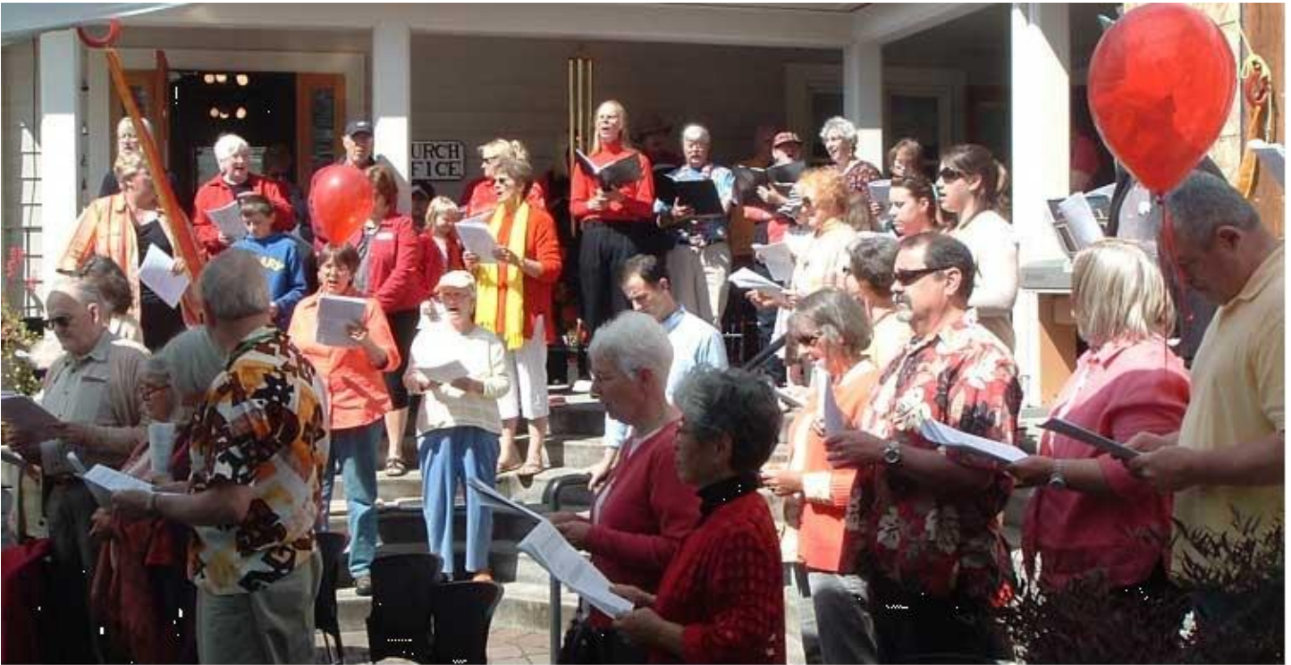
Outdoor services in the Courtyard of All Souls