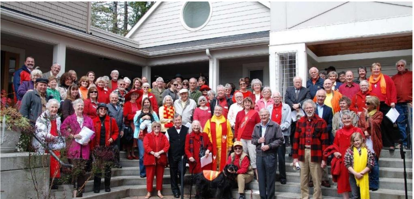
Saints of St. Paul's on Pentecost Sunday