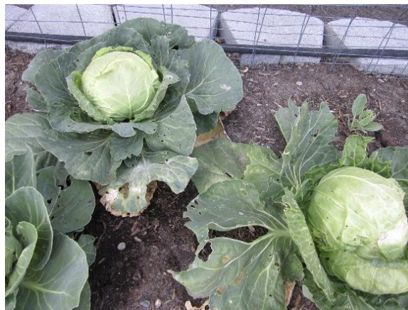
Cabbages in St. Paul's Community Garden

St. Paul's is also committed to justice and the stewardship of our planet. Recently a group from St. Paul's visited a Palestinian parish in Jerusalem and, in turn, welcomed the Palestinians for a visit to St. Paul's. We provide space for the Bet Shira Jewish gatherings, and we enjoy an excellent relationship with Port Townsend community. Our Greening Task Force works to educate the parish and maintain our commitment to a healthy environment. We play a critical role in the local Food Bank, and Port Townsend Emergency Shelter relies on our annual volunteer efforts. We donate to the county animal shelter. St. Paul's weekly "Just Soup" offers a white-table-cloth meal, including donations of clothing and supplies, to anyone in the larger community who wishes to join us in breaking (homemade) bread. Soup ingredients are often harvested from our own vegetable garden.